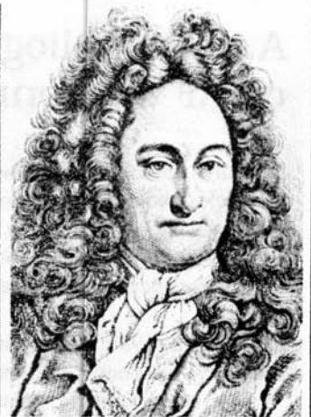
From left: Karl Gauss, Johannes Kepler, G.W. Leibniz. The scientific tradition represented by these men formed the basis for LaRouche's understanding of the way in which the revolutionary new weapons now emerging accomplish their nonlinear effects.

cance of such weapons among relevant senior military specialists of several nations with which I have been in communication.