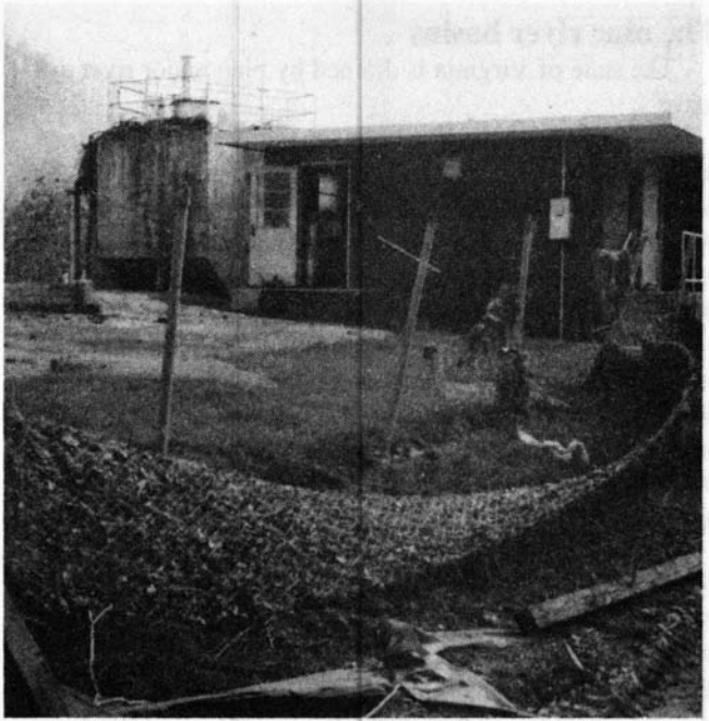
The Buchanan town sewage treatment plant was severely damaged, and shut down, by the raging James River in the November 1985 floods.

age rate of 837 mgd and leaves near Glen Lyn at the rate of 3,237 mgd. The watershed totals about 7.5% of the area in the state.