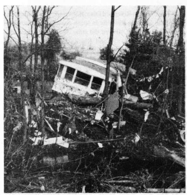
House trailers were upturned and swept away in this 300 unit trailer park in Roanoke, as the Roanoke River flooded in November 1985.