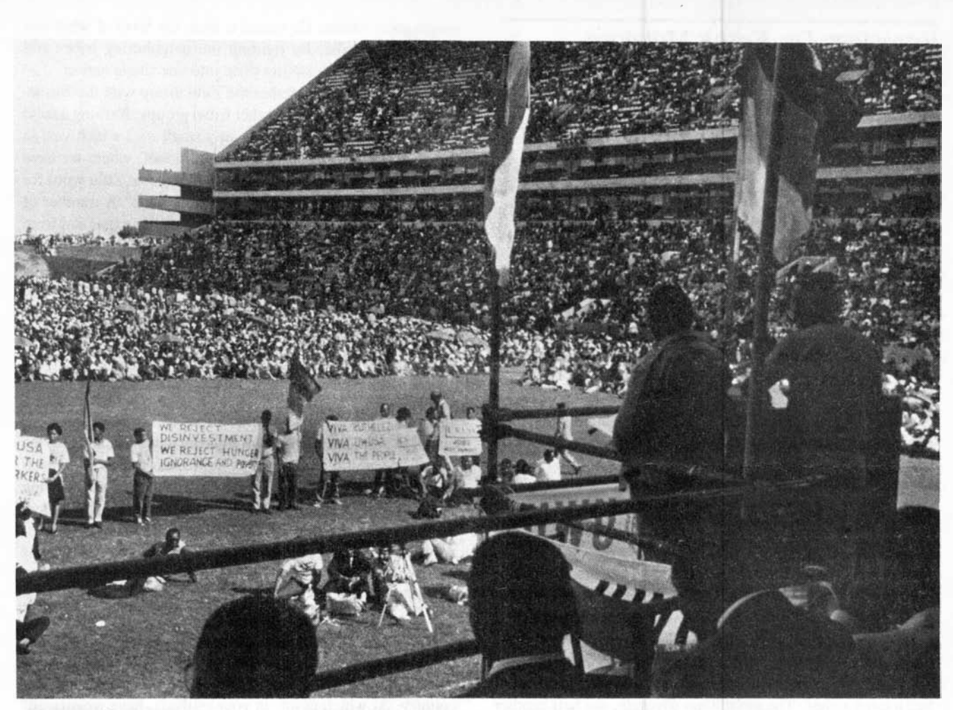
Mangosuthu Buthelezi, chief minister of KwaZulu, addresses 80,000 people gathered at a stadium in Durban for the founding of the United Workers Union at South Africa on May 1.

was dead earnest in pushing everybody to take independence, thereby renouncing all claims to the wealth of South Africa: to the gold mines, the diamond mines, the coal mines, and the industrial developments in Johannesburg and Capetown, Braamfontein, and Durban, and what not. They wanted us to clear out of all the wealth of South Africa, so that we could be confined to arid areas full of stones. Now, we were the ones who decided no, we shall not allow the South African government to do that. We in KwaZulu realized, if we just stay out, fold our hands and say, "We don't agree, we don't agree," we'll find ourselves eased out of South Africa and rendered impotent. The South African government will just put up their stooges to take over the KwaZulu government, which would go along with those stooges to formulate an independent KwaZulu. So what we did, those of us who resisted, we decided to grab the machinery of KwaZulu government and stop South Africa from letting KwaZulu become independent.