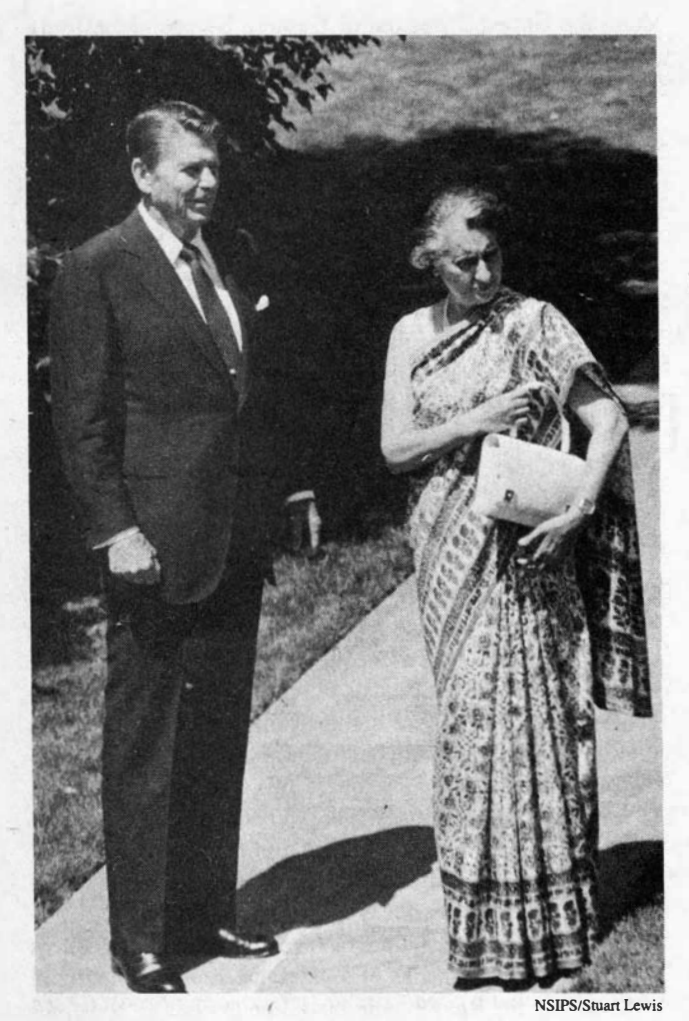
The terrorist international is targeting heads of state for assassination, and the threat will grow in the coming weeks unless the intelligence agencies of the United States and its allies take on the real terrorist-contol apparatus. Shown: President Reagan with the later assassinated Indian Prime Minister Indira Gandhi.

illegally parked just 10 meters from the main training building that a bomb search was ordered. Oberammergau officials acknowledged that had the bomb blown up, a large number of U.S. and NATO officers would have been killed or injured. The fact of the RAF terrorists adopting the modus operandi of the Islamic fundamentalist terrorists who blew up the U.S. embassy and the Marine compound in Lebanon was not missed by Western security services evaluating the "new" profile of the European terrorists.