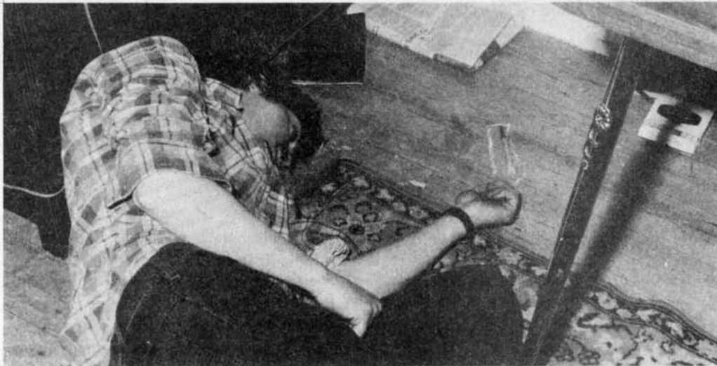
Dope, Inc. has claimed more victims than many wars.

ficials describe instances where headquarters banks have removed competent offshore managers for their failures . . . to optimize profits through corrupt relationships.”