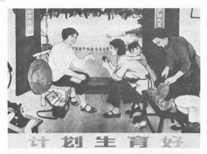
China's campaign for the one-child family. In this poster, a "barefoot doctor" explains oral contraceptive use to the happy and prosperous mother of a single child.

vited to China last year and is reportedly working on a "China 2000" paper recommending population control methods suitable for the "specific conditions" of China.