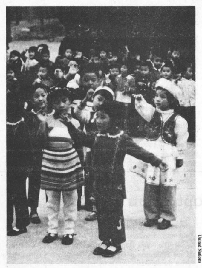
China's population potential, considered an encumbrance to economic growth by the Malthusians of East and West.

tality levels which plagued its peoples and initiated a major health care drive to extend the longevity of the population. This was so successful that the population doubled in size. In 1979 the average lifespan of the Chinese was 64 years; in India it was 51. To engage in a program that severely cuts into the infant mortality and simultaneously extends the lifespan of the population over 30 years in which the population doubles from 500 million to over a billion is not generally the thrust of a society bent on internal genocide.