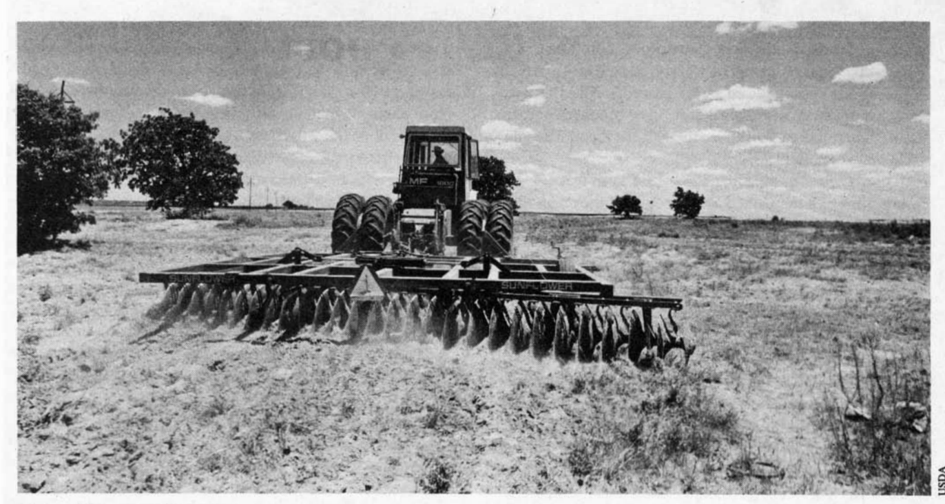
The cutoff of credit to the highly mechanized farms of Europe and America means bankruptcies ahead and the threat of world food shortages. Shown is a four-wheel drive diesel tractor in Texas.

basis. If this continues, millions of European farmers will face bankruptcy in 1984 (see article, page 23).