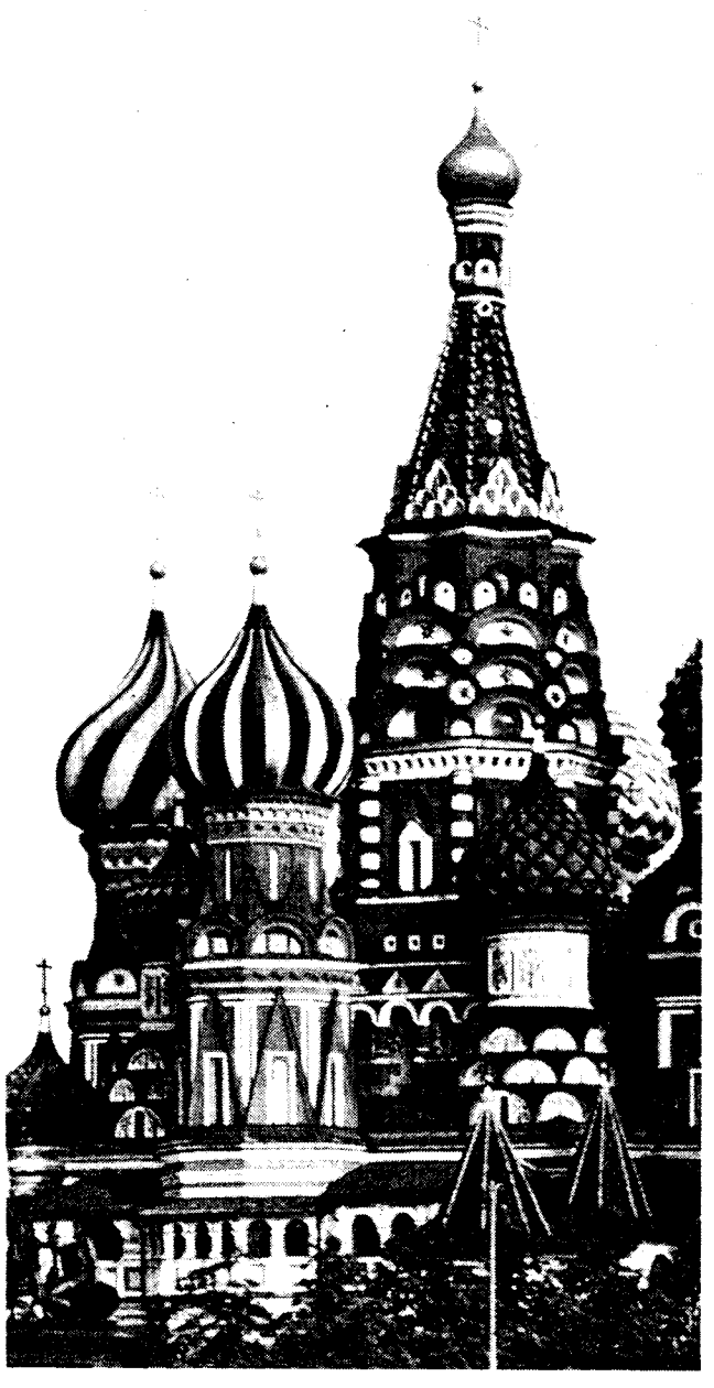
The Russian Orthodox Cathedral of Vasily the Blessed in Moscow's Red Square.

is the ability of Americans including the Reagan administration, to recognize that practical connection, on which the possible survival of the United States now depends. Arab governments, comparing the EIR analysis with the circumstances of the assassination of President Anwar Sadat, recognized EIR's analysis to have been correct—and have acted accordingly. The same method could conceivably blow open the present collaboration among London, Moscow and Jerusalem. That is what leading SIS officials have stated they fear EIR's work might possibly accomplish.