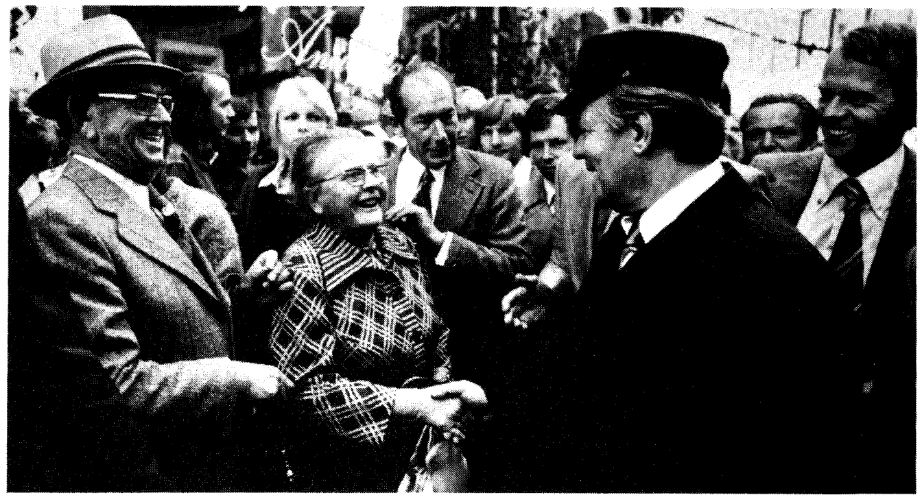
Helmut Schmidt, in Hamburg cap, on campaign tour.

presidential contest. West German voters can do something more than choose among competing brands of Trilateral Commission degeneracy. This is true because Schmidt and Zepp-LaRouche, on the one hand, and Strauss and company, on the other, represent the two hostile policy factions that are presently struggling for control of Europe and the world.