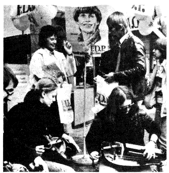
Folk musicians campaign for the FDP.

nuclear only to cover energy needs that cannot be met by coal and a hodgepodge of "renewable" sources.