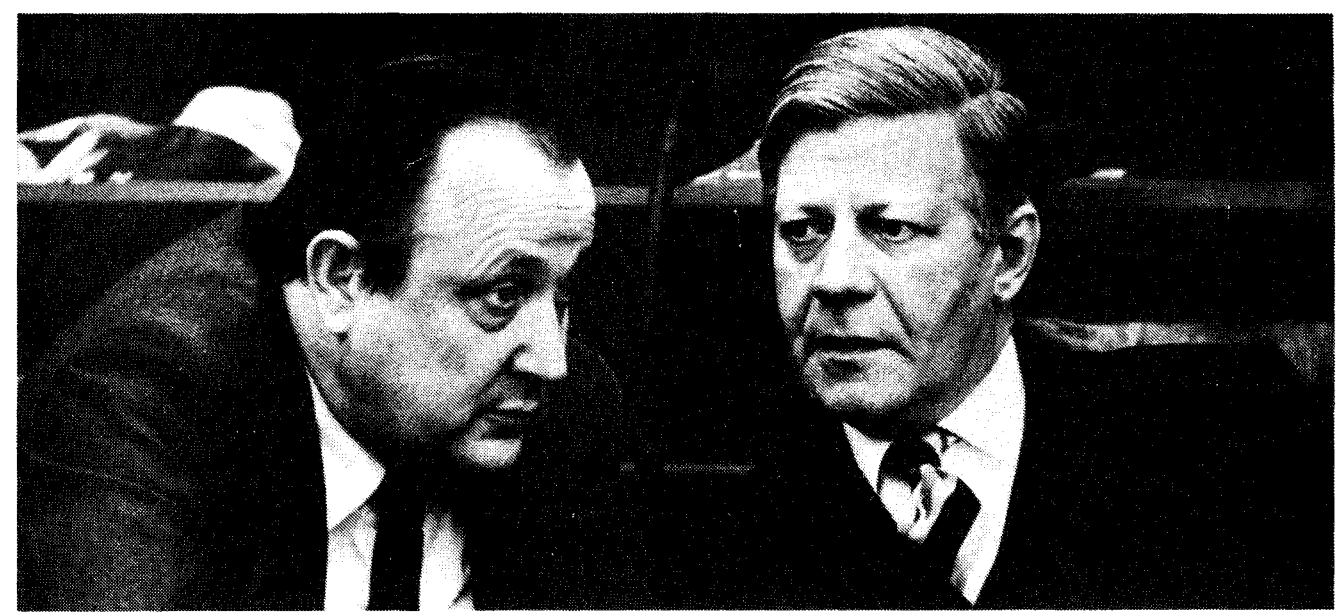
Foreign Minister Hans-Dietrich Genscher (1).

issued a stinging attack on the West German media and "revanchist circles" for blatant interference in the Polish situation, there can be little doubt that Wehner's networks in the East bloc, including various networks dating back to the infamous SPD Ostbüro espionage and subversion operation of the cold war years, were being targeted.