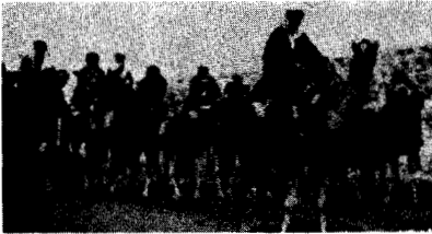
On the cover: British intelligence officer H. St. John B. Philby, who created the Muslim Brotherhood in the 1920s.