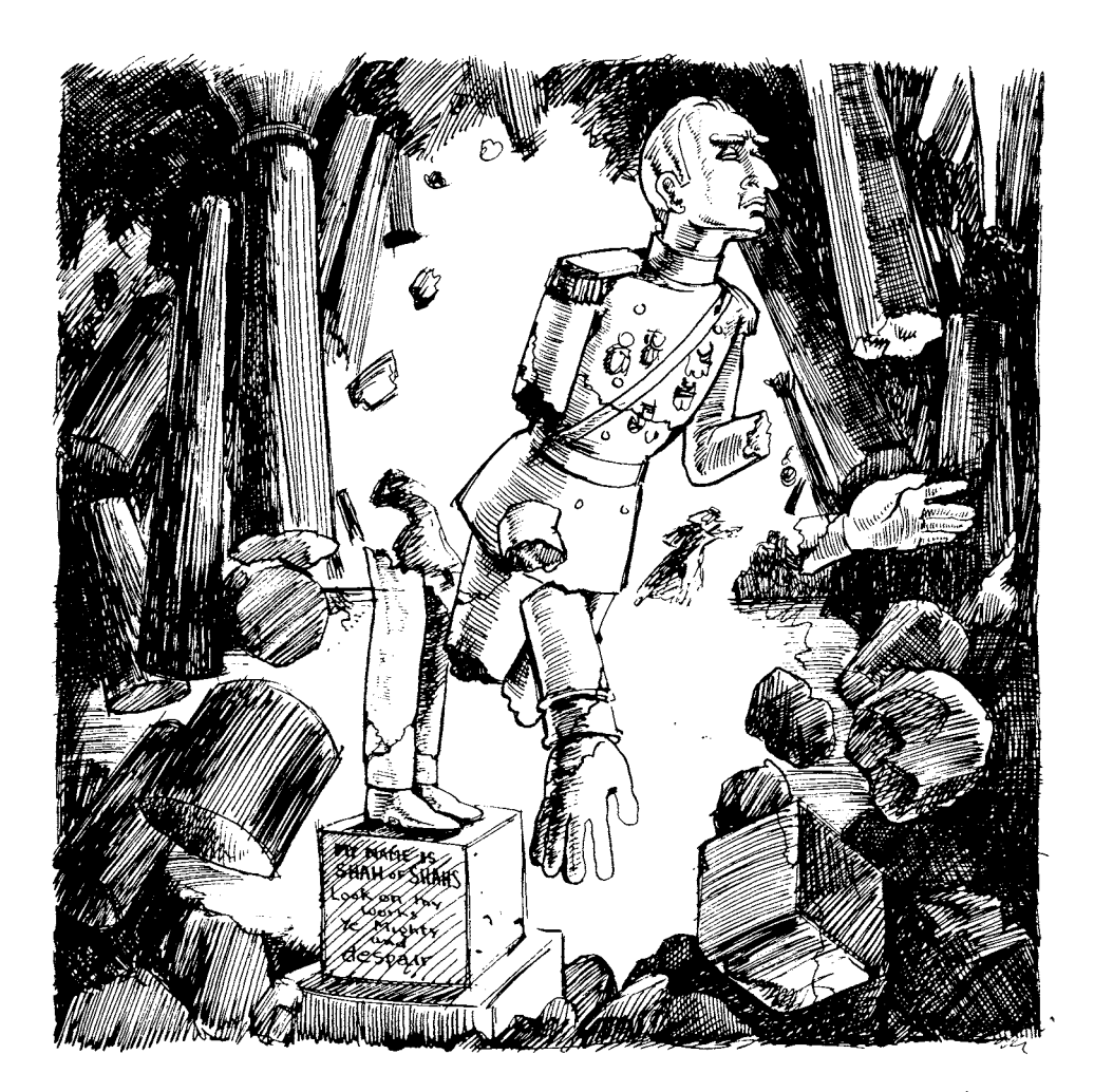
Persian Rug Slipping Out From Under the Shah