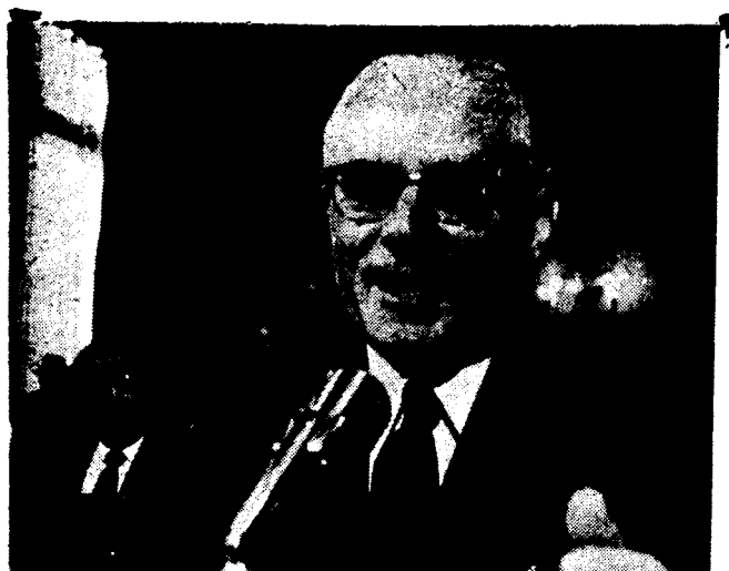
Butz conservatives who want to "keep the food at home" play right into Rockefeller's controlled environment.

The division between the Butz conservatives and the more sophisticated Rockefeller tendency has little practical significance. Butz' resistance to government-held reserves, like that of most farmers, plays into the Rockefeller gameplan by limiting debate to who should store the grain. Butz' opposition avoids the only real concern — a full exposure of how the Rockefeller cabal is