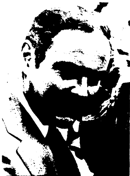
Gen. Haig is as expendable as Nixon, Brandt, Kissinger, Ford, et al. His days are numbered.