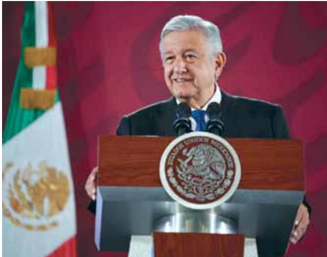
Gobierno de Mexico