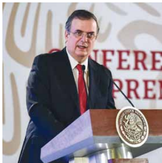
Gobierno de Mexico