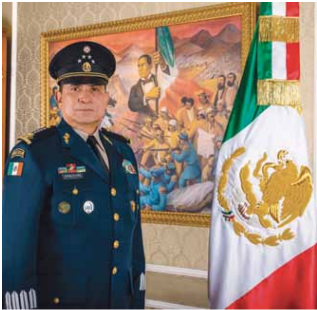
Secretario de la Defensa Nacional

General Luis Cresencio Sandoval González.