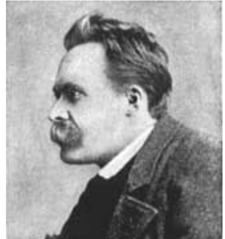
Leo Strauss as a young man in Germany (left) became a Zionist and admirer of Vladimir Jabotinsky, and was also permanently “gripped” by the writings of Friedrich Nietzsche (right), whose lunatic “superman” ideology inspired Hitler and his Nazis.

been wise counsel in 1823, when America was a small, isolated power in a world of European giants, is no longer so, when America is the giant. Because America has the capacity to contain or destroy many of the world’s monsters, most of which can be found without much searching, and because the responsibility for the peace and security of the international order rests so heavily on America’s shoulders, a policy of sitting atop a hill and leading by example becomes in practice a policy of cowardice and dishonor.”