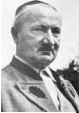
Strauss, before being posted to Paris and London by Carl Schmitt in 1932 and beginning his long University of Chicago career spawning the leading U.S. neo-conservatives, was an enthusiastic supporter of Martin Heidegger (left), the top intellectual enforcer of Adolf Hitler's Nazism on German universities.