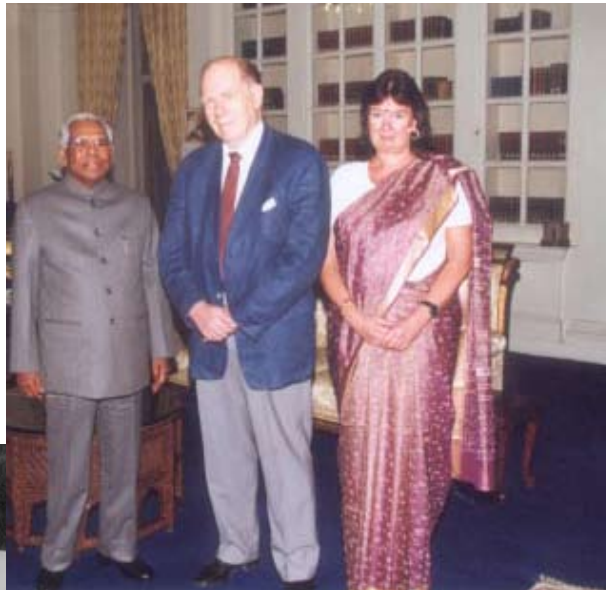
Office of the Indian President

The LaRouches travelled to India in January 2003, to promote development of the “Strategic Triangle” of cooperation among India, China, and Russia. They visited Kolkata (Calcutta); the University of Jaipur, in Rajasthan (below); and New Delhi, where they met with Indian President K.R. Narayanan (right). The clipping shows front-page coverage of LaRouche in India’s leading daily, The Hindu, May 27, 2003.