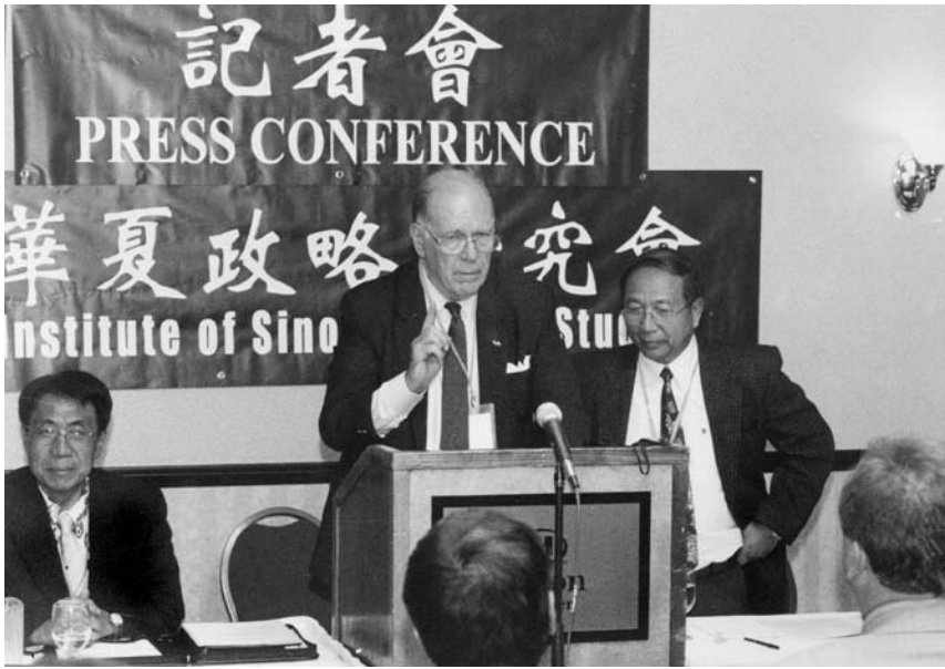
Lyndon LaRouche gave the keynote address to a conference of the Institute of Sino-Strategic Studies, attended by scholars and political activists from the U.S., Taiwan, and the People's Republic of China, in Whittier, Calif., August 2002. He is shown here at a press conference following the speech. China Daily published an interview with LaRouche in 2005 (right).

fact that he had interviewed LaRouche in prison, in 1993, and he gave the link to our site. So, that's how we came to have thousands of people reading an interview from 16 years ago, as highly relevant to the question of whether these four countries could, and will, take the initiative to bring the world out of the danger of an immediate Dark Age now.