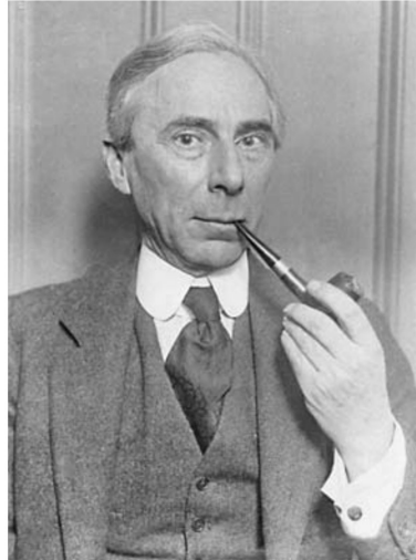
“To give that sickness an historically, precisely accurate name, recognize it as ‘The Jeremy Bentham Syndrome,’ as the ‘Open Conspiracy’ madmen, the Benthamite pair of H.G. Wells (left) and Bertrand Russell (above), typify the very worst of the evils which the past century has bequeathed to the present one.”

by Bertrand Russell, who continued that conspiracy for the remainder of his wretched life. In Wells’ own published words, that conspiracy is as follows: