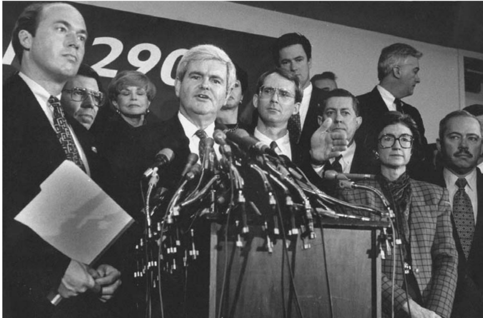
Former House Speaker Newt Gingrich and some among his Conservative Revolutionaries. The Republican "Southern Strategy" was an appeal to the "fundamentalist" bigots who brought Nixon and Kissinger into the White House, and began the process of wrecking the economy and morals of the U.S.A.

lateral Commission lackey and Zbigniew Brzezinski confederate Samuel P. Huntington, a perspective set forth by Huntington under the Carter-era rubric of a so-called "crisis of democracy." Thus, Project Democracy, better named "Project Lying Demagogy," was installed as the authority over both leading political parties, in 1982.