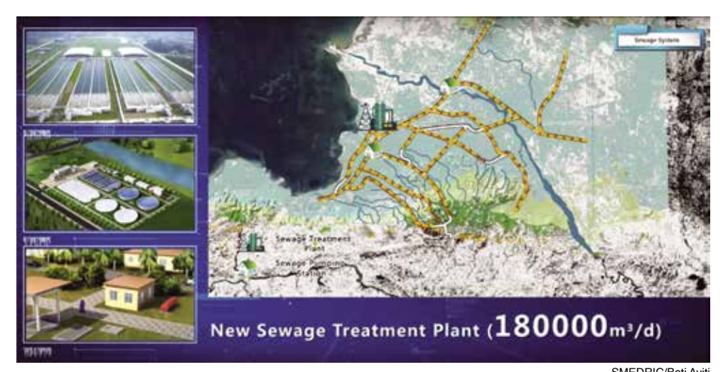
A sewage removal and treatment proposal from 2017—one component of a new, comprehensive infrastructure plan developed by China's Southwest Municipal Engineering Design and Research Institute to renovate and rebuild Port-au-Prince and its port.

The 2017 <u>proposal</u> by China's Southwestern Municipal Engineering Design and Research Institute to spend $4.7 billion to completely renovate Port-au-Prince, with modern sanitation and drainage systems, transportation, a sewage treatment plant and reconstruction of the port, was sabotaged by the IMF.