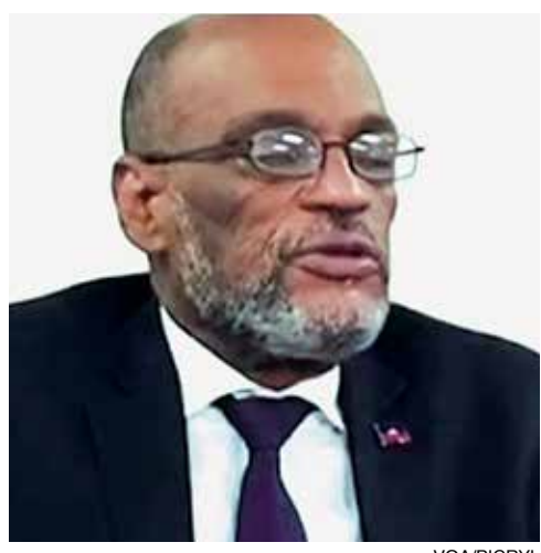
Ariel Henry, the never-elected, now former Prime Minister of Haiti, did nothing to improve an economy crushed by IMF austerity policy.

ignation from Puerto Rico, where he had been forced to take refuge after gangs shut down Port-au-Prince's Toussaint Louverture International Airport, locking him out as he returned from a trip to Kenya. There, he had tried to finalize details on a Kenyan policeled Multinational Security Support Mission (MSSM) organized to deploy to Haiti to assist the national police in combating violent gangs.