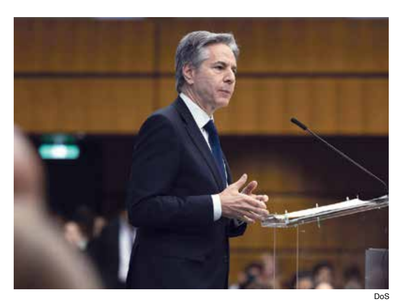
U.S. Secretary of State Antony Blinken's proposal for a "transitional council" for Haiti would merely continue the imperial policy of denying sovereignty and economic development, to be enforced by a U.S. proxy police deployment from Kenya.

haps because the U.S. hand is all over this "Haitian-led and Haitian-conceived" proposal. According to The Washington Post March 13, Secretary of State Tony Blinken spent time at the meeting