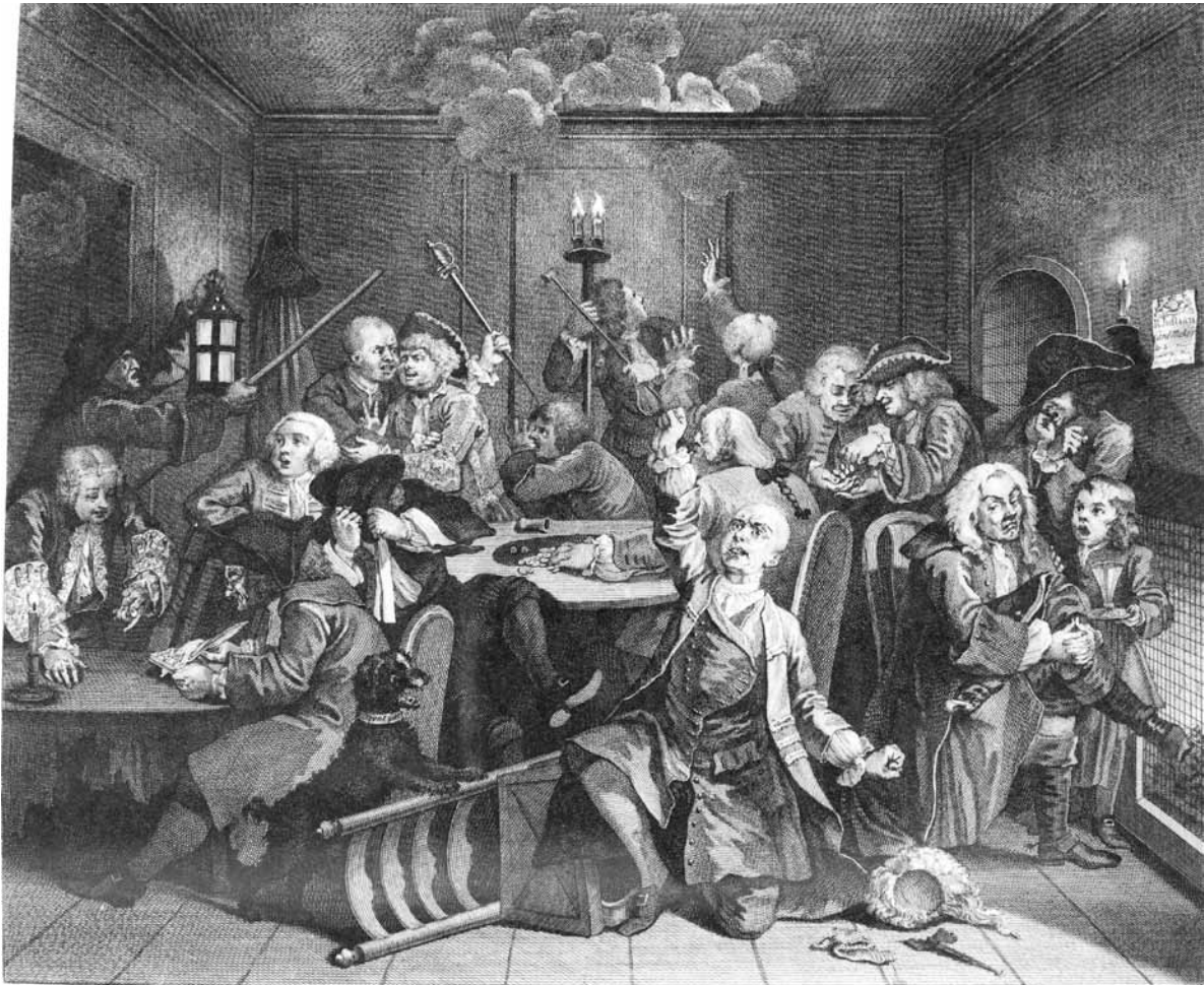
Plate VI from William Hogarth's "A Rake's Progress," in which the rake, having lost a fortune at gambling, is now half mad. "The moral citizen is he, or she, who situates the notion of self-interest, not in personal profit or loss, nor immediate pleasure or pain, but rather with respect to one's personal world- historical place in the course of history as a whole. . . . It is this location of one's self-interest, which defines the only truly happy persons on this planet, the kind which laughs in the Devil's face."

notion of self-interest, not in personal profit or loss, nor immediate pleasure or pain, but rather with respect to one's personal world-historical place in the course of history as a whole. Thus, that person is moral, because his, or her notion of world-historical interest approximates the principle of an order within the meaning of a simultaneity of eternity. It is this location of one's self-interest, which defines the only truly happy persons on this planet, the kind which laughs in the Devil's face.