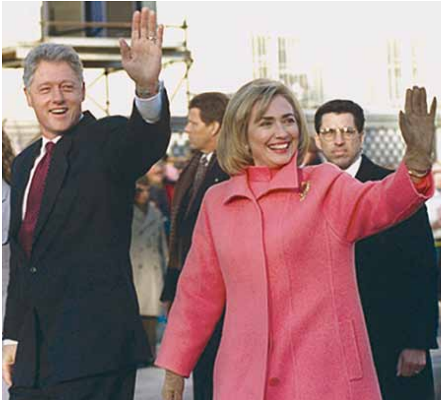
President Bill Clinton and the First Lady. The readers' deepest shock "comes as a reaction, not to the proposal that existing policies must be radically, and even quickly changed. The most profound shock is the result of their confrontation with the evidence, that the mind of both the President and most other citizens must now undergo, quickly, a radical change, away from what most of them had believed up to now."

minds of people, inside and outside the U.S.A., since the new outbreak of world-wide financial and monetary crises during the August 17-31 interval. 11