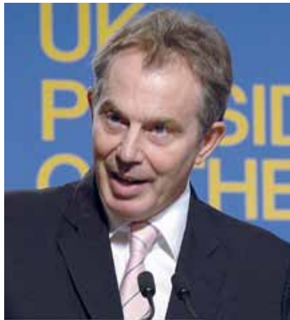
Council of the EU