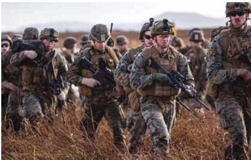
NATO U.S. Marines in NATO’s “Trident Juncture” exercise in Iceland on October 17, 2018.

With the long awaited conclusion of Special Counsel Robert Mueller’s investigation in sight, Democrats