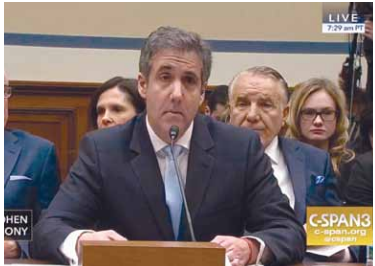
Michael Cohen, former Trump lawyer, testifying before the House Oversight Committee on February 27, 2019.

Following the Democratic Party’s takeover of the House of Representatives in November 2018, Trump challenged the Democrats: “You can either choose to tie the country up in endless investigations, or we can cooperate on matters of bipartisan concern, such as infrastructure investments, lowering the cost of prescription drugs, trade deals, border security, etc.” As it has become clear, with their launching of the “subpoena storm,” that leading Democrats have no desire to coop-