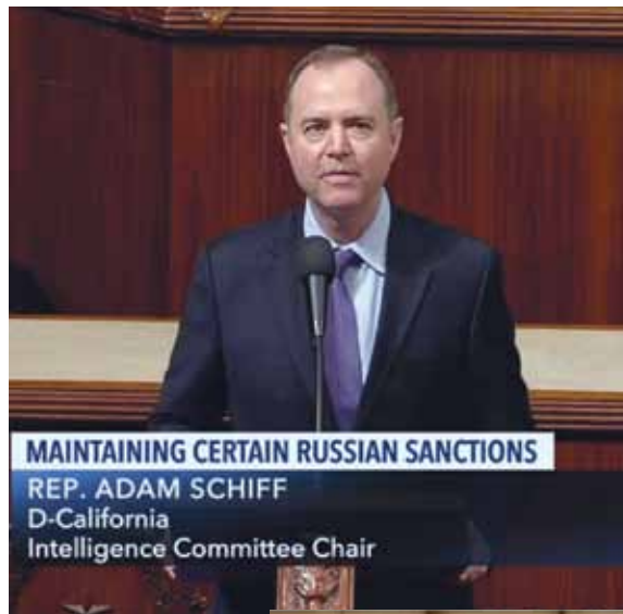
Representatives Schiff (left) and Nadler (below) are leading figures in the effort to paralyze the foreign policy of the United States.

Many of these Congressional Democrats are now flirting with crossing the line into an open insurrection against the U.S. Constitution. They are dipping their toes into the pool of outright treason. Make no mistake. The current anti-Trump offensive is replete with lies, dishonesty and unlawful actions, all grounded in an intention to return U.S. policy to an aggressive anti-China, anti-Russia war stance. That is the intention. Any contrary narrative, such as can daily be seen on