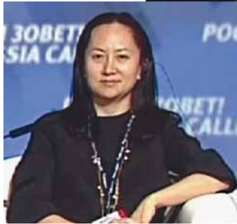
Meng Wanzhou, CEO of Huawei, in 2014.

In this assault on Huawei, once again, the British