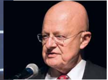
James Clapper