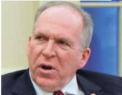
John Brennan