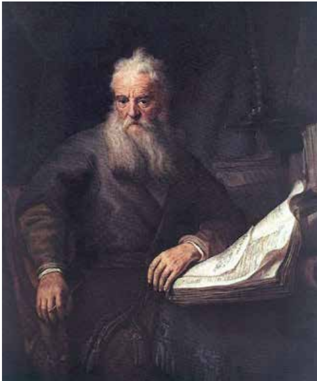
The morally superior cultural impulses of mankind define the need for a fight against oligarchism, and “practical” ideologies, in favor of the intellectual qualities of the human soul. “Apostle Paul,” as depicted here by Rembrandt, fought the bestial Roman Empire on behalf of a true morality.

through contemporary European and U.S. traditions, are ably instructive on this account.