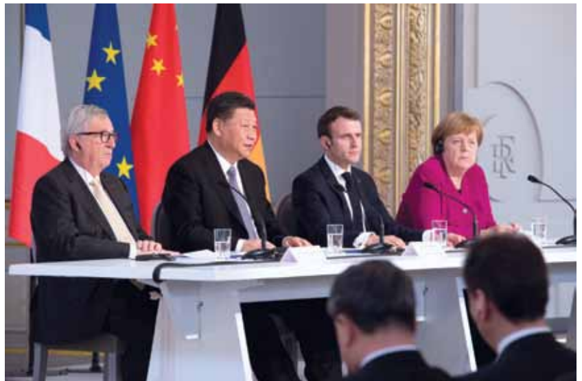
EC President Juncker (l.) and German Chancellor Merkel (r.) joined French President Macron and Chinese President Xi for talks in Paris on March 25, 2019.

Immediately after the visit of Xi Jinping, Michele Geraci went on to the March 26-29 Boao Forum for Asia, in Boao, Hainan Province, China—the Chinese equivalent of the Davos forum in Switzerland—where he gave a very upbeat interview to the South China