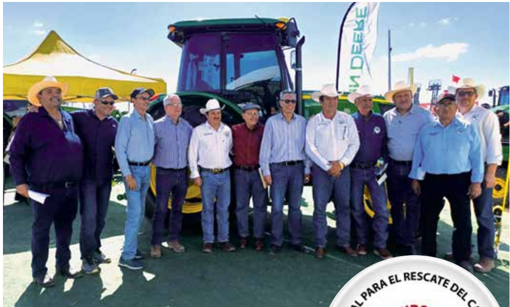
Farm leaders of the National Front to Save the Mexican Countryside, on the grounds of ExpoCeres 2024, Los Mochis, Sinaloa, Mexico, March 15, 2024.