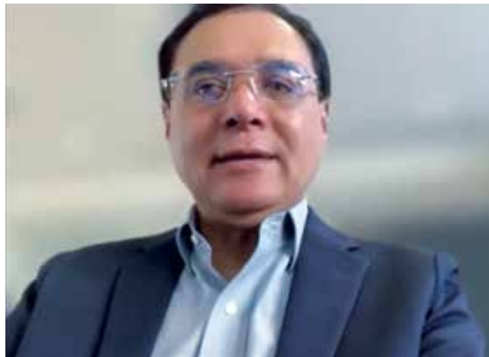
Schiller Institute Mexican Congressman Benjamín Robles Montoya.

March 13— The Congressman Benjamín Robles Montoya of Mexico issued the following “Letter to Current and Former Legislators of the World” on the letterhead of the Chamber of Deputies, LXV Legislature. It is dated Mexico City, March 13, 2024.