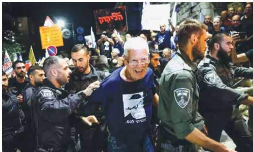
Hundreds of angry protestors chant “Jail Now!” outside the residence of Israel’s Prime Minister Benjamin Netanyahu in Jerusalem, Nov. 4, 2023. Officially charged with fraud, breach of trust, and bribery, only the war he has engineered in Gaza has enabled him to stay out of jail. More than three-quarters of Israelis believe he should resign.