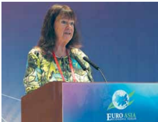
Helga Zepp-LaRouche addresses the 2019 Euro-Asia Economic Forum Think-Tank Meeting in Xi'an, China on September 11, 2019.

In fact, China has opened a new, totally inspiring chapter of universal history, by setting an irrefutable example, for all other developing countries, of a way to overcome poverty in a relatively short period of time and achieve a good standard of living for a growing segment of its population. Over the past 40 years, China has implemented the most massive anti-poverty program in human history, lifting 850 million of its own citizens out of poverty,