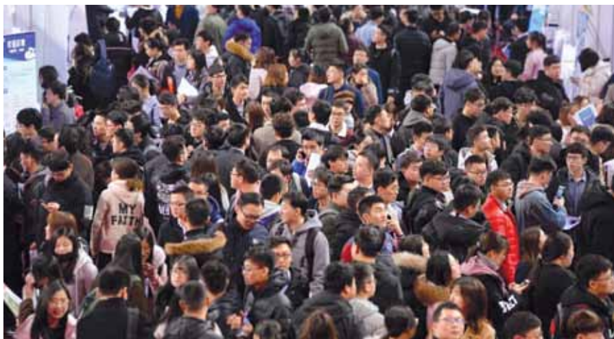
VOA Students are seen at a job fair for graduates at a university in Shenyang, Liaoning province, China, March 21, 2019.

of per capita purchasing power. Since 2015, China has had the largest middle class in the world, and President Xi Jinping has personally committed himself to freeing