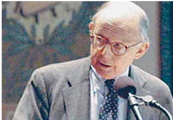
Samuel P. Huntington

The anti-China propaganda is in no way something new; it comes from the resentment consciously stoked by the European colonial powers. The pejorative expression, “the yellow peril,” appeared at the turn of the 20th Century in all sorts of books, short stories, sketches, and caricatures. It insidiously stoked fears about Asian peoples, because the geopoliticians of the British Empire feared that their power in the world could be broken by the development of Eastern Asia. The same type of thinking is displayed by Samuel Huntington in his Clash of Civilizations , a book soaked in ignorance, or more recently by the former Director of Policy Planning at the State Department, Kiron Skinner, who came out with the racist statement that the United States is confronted for the first time with a competing superpower which is not “Caucasian.”