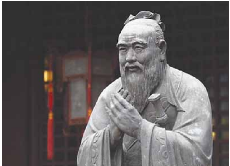
China has a very different social system, a meritocracy developed over more than two millenia, based on the Confucian tradition. Shown, statue of Confucius at Confucian Temple in Shanghai, China.

The same applies emphatically today to the United States and China: If the two largest economies in the world work together to overcome poverty in the world, and to develop new advanced technologies such as nuclear fusion and cooperation in space, then all of mankind will benefit from it throughout the future.