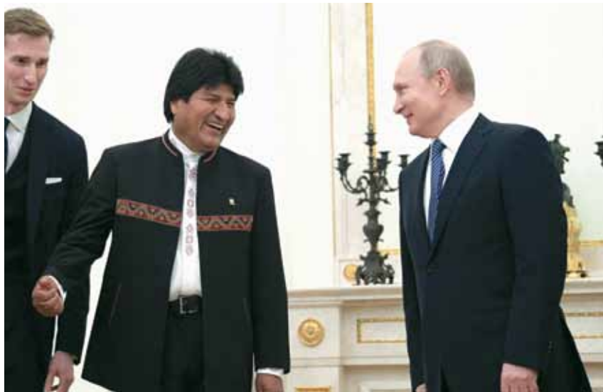
Russian President Vladimir Putin (right) welcomes Bolivian President Evo Morales for economic development talks at the Kremlin, July 2, 2019.

But if you look at some of the other Western countries—especially Germany, which is breaking my