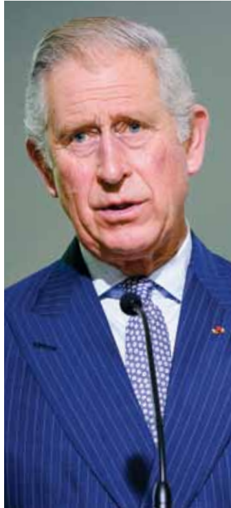
Prince Charles, in 2015.

People have a short memory, but these catastrophic announcements—Prince Charles came out and even changed the view of the Intergovernmental Panel on Climate Change (IPCC) that the world has only 12