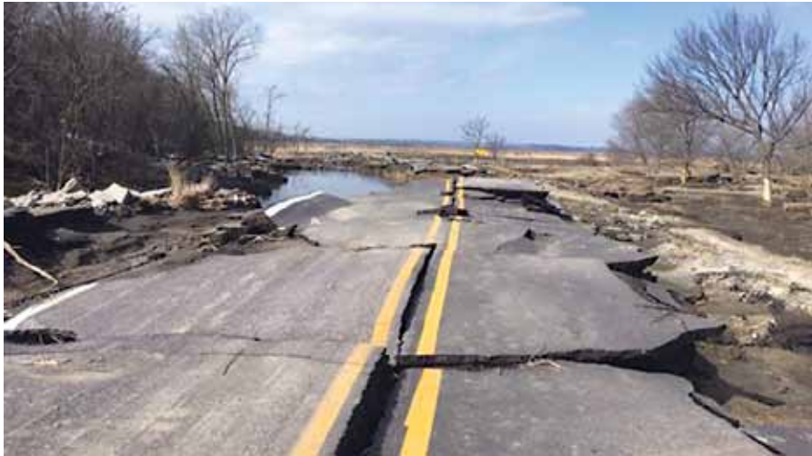
Nebraska State Patrol