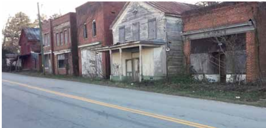
Robert L. Baker

For example, secluded areas on farms are targeted by meth lab operators—sometimes in pop-up facili-