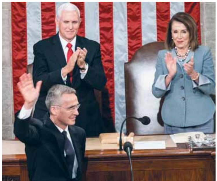
NATO Secretary General Jens Stoltenberg applauded by Vice President Mike Pence and House Speaker Nancy Pelosi after his anti-Russia address to a special joint session of Congress on April 3, 2019.

So your next question should be: “What is this war party really up to—given the existence of a whole chorus of such people?” The U.S. Ambassador to NATO, Kay Bailey Hutchison, also talked about the aggressive behavior of Russia. But it was NATO that announced it will be increasing its presence in the Black Sea. In the context of the upcoming, final election in Ukraine, we really must be attentive to further provocations. Then you had several of the leading members of the Atlantic Council