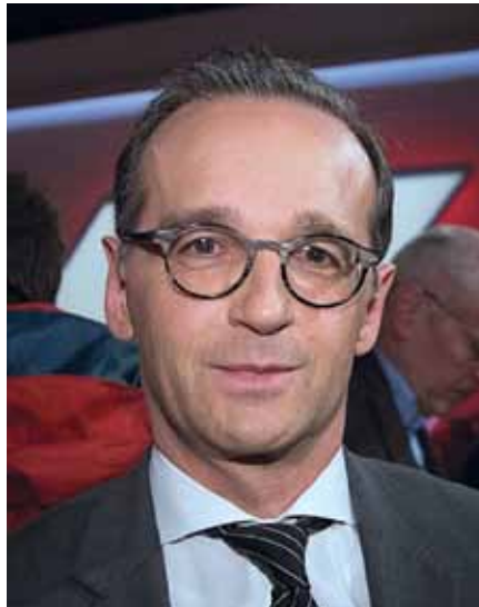
Heiko Maas, German Minister of Foreign Affairs.

away to China, but instead hopes to intensify trade with China: “With the present Memorandum of Understanding, we are trying to make good lost time. The Germans have done that in the past 10-15 years, rather well. We however do not have another 10-years’ time. What we are doing now is a means of acceleration.” An “acceleration program made by Geraci,” DLF commented, claiming that Geraci was the only “economic professional” in the Italian government, charging it with not knowing anything about economic issues at all.