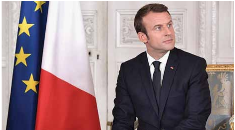
President of France Emmanuel Macron.

Under the pressure of this heavy harassment by Bildzeitung , the Ministry of Transport made it known the same day, March 20, that it no longer supported the BVDSI, and that it no longer shared the views of the association. On March 21, Bildzeitung gloatingly reported the ministry's statement. Much of the tabloid's arguments against China originated with the Sino-phobe Mercator Institute for China Studies (MERICS) in Berlin, which in its latest “China Update 6/2019,” complained that “irrespective of mounting European