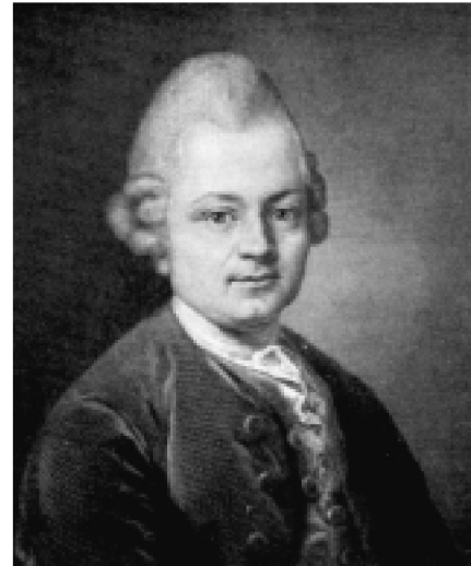
Moses Mendelssohn, Abraham Gotthelf Kästner, and Gotthold Lessing led in changing the course of history in their time. Their collaboration, “with its connections to Benjamin Franklin in North America, became the focal point for the resistance against the moral and intellectual corruption represented by the so-called Enlightenment.”

the culture of a Florence had been, to bring upon itself the punishment enacted on the streets there, across the river, below. I thought of our present times, and knew that a similar outcome awaited us, if our increasingly decadent culture were not reformed.