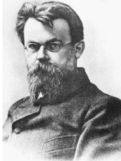
Vladimir Ivanovich Vernadsky (1863-1945). " Genesis 1 , like Vernadsky, defines a universe composed of three distinct phase-spaces, the non-living, the living, and the cognitive, each and all subsumed by a universal Creator." Vernadsky provided the first conclusive physical-scientific proof of the principle that only life generates life.

per capita and per square kilometer . Without the cumulative effect of mankind's discovery and use of universal physical principles by sovereign individual minds, humans would be stumbling about like poor apes, with brief life-expectancies, and conditions of life like those of the mere beasts.