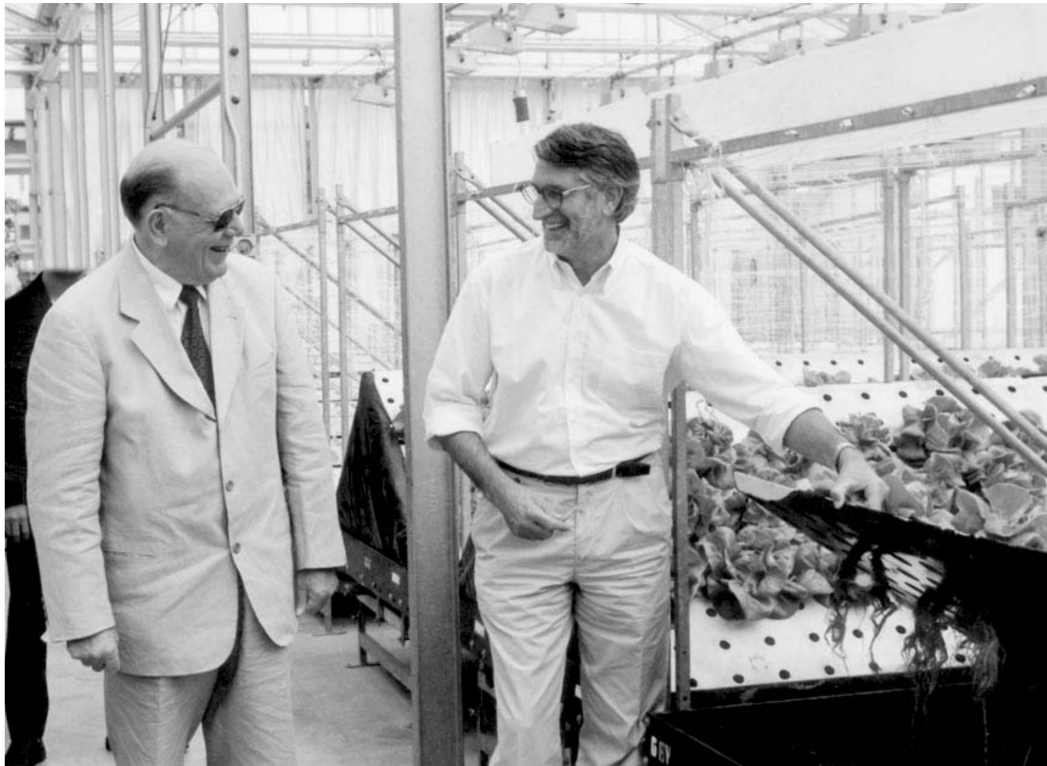
Lyndon LaRouche visits an aeroponics plant in Italy, July 2001.

We have now the threat of generally spreading warfare throughout the world, particularly since the Sept. 11 terrorist attacks in the United States—largely, an internal operation, but, obviously, may have involved elements from other parts of the world, as participants in the operation. We have not seen the end of it. No one has stopped the terrorists. No one has identified yet the terrorists, the actual ones, so, they're sitting there, ready to strike again.