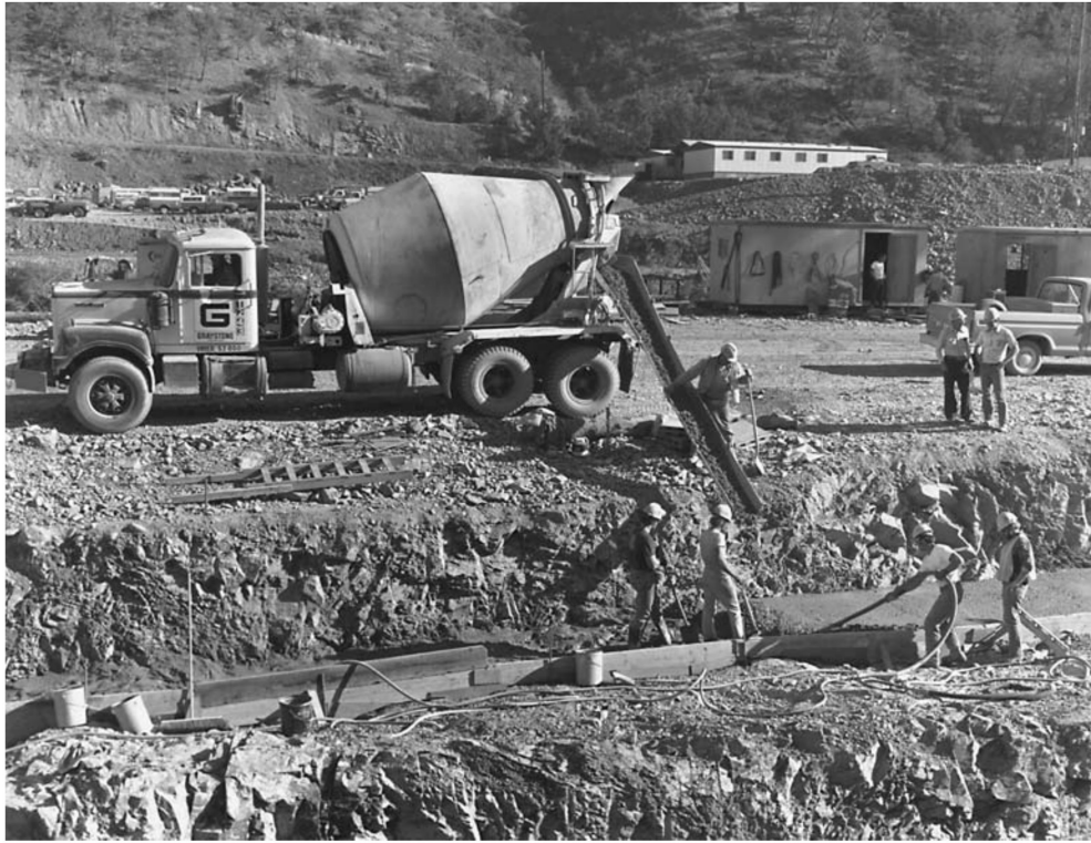
In South America, the military can play a positive role, not simply as a combat arm, but as a corps of engineers, a transmission belt for building works of national importance. Here, the U.S. Army Corps of Engineers works on dam and reservoir construction at Applegate Lake, Oregon.

we can get out of this. The lessons of the past show us.