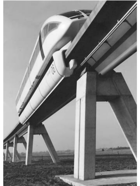
A maglev system is particularly well-suited for Peru's mountainous terrain. "We need large arteries, not just of highways, but arteries of corridors of transportation and development," says LaRouche.

We're able to improve the biosphere, by use of technology. We can create fertile areas where deserts existed. We can have forests where there were no forests. We can improve the management of water. We can improve the weather. So, we should do it. So, therefore, our objective in ecology, the strategic question of ecology, should be : We should promote those measures of infrastructure development and maintenance, which are necessary to improve the conditions of life, the biosphere. Yes, we should do that.