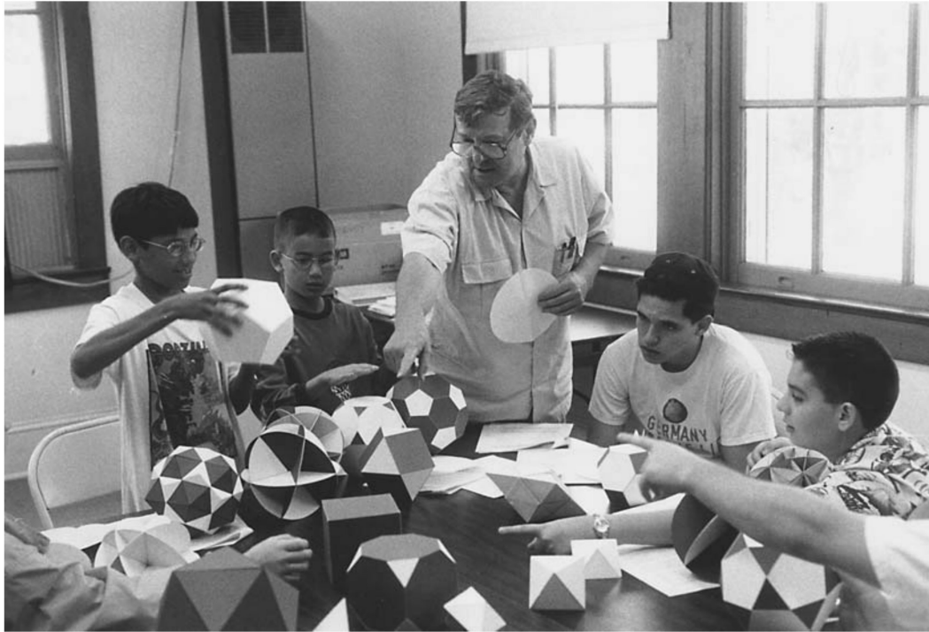
“A student today, a young student, in a good school, can reenact some of the discoveries of principle made by Archimedes.”

rediscovering their argument; that student would have all of these people living in the student’s own memory, not as a memory of a picture, not as a memory of some words, but a memory of the act of argument, the act of discovery. That is what the model is of a Classical humanist education.