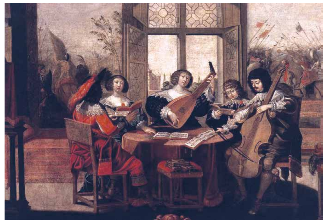
The lawful ordering of the universe is found in the transformations of verbal action in literate languages, well-tempering in classical music, and in the topology of constructive geometry. Here, a painting titled Hearing by an unknown artist based on an engraving by Abraham Bosse from c. 1635.

philology in promoting the quality of science and citizen-soldier essential to in-depth capability in arms.