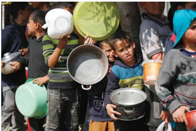
UNRWA Facebook Page

I think this is the most fantastic development, and if people in the West would not be so completely decadent, they would be happy about that! What better situation than to end the poverty for literally billions of people around the world! And one can only hope that the present motion to increase the BRICS—the BRICS are now BRICS-10; soon they will be BRICS-40 or -50, because 40 countries have applied for membership.