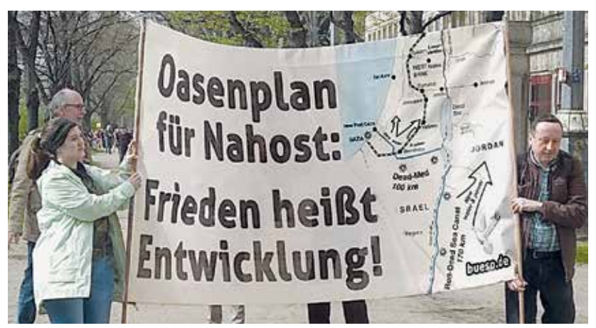
BüSo activists in Berlin with their sign: "Oasis Plan for the Middle East: Peace means development!"

is clearly unhappy with the accompanying destruction of the real economy and the welfare state. Likewise, the horror over Israel's inhumanity in Gaza and the hypocrisy of Western politics—with its empty words "human rights" and "Western values"—is growing rapidly.