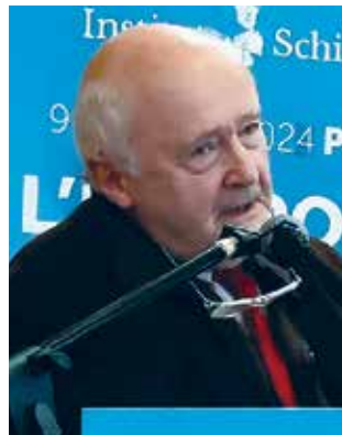
Schiller Institute Brice Lalonde

The former French Minister for the Environment (1988-1992), Brice Lalonde, gave a brief overview of the challenges he faced as Minister. On November 1, 1986, a gigantic fire ravaged a chemical plant in Basel, Switzerland. The fire was extinguished, but the toxic waste had contaminated the entire Rhine Valley, killing virtually all life in the river. The question then arose: "How can we bring the Rhine back to life?"